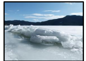
ice sheets (layers of ice that cover the land for a long time)