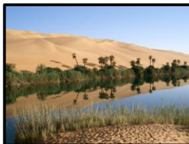
an oasis (a place where water is found)