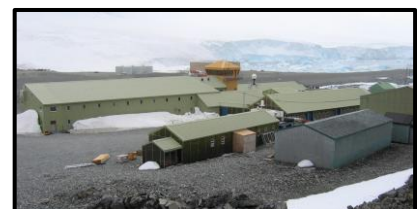
research stations (Antarctic)