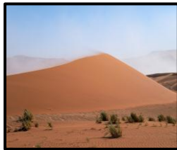
sand dunes (hills made of sand)