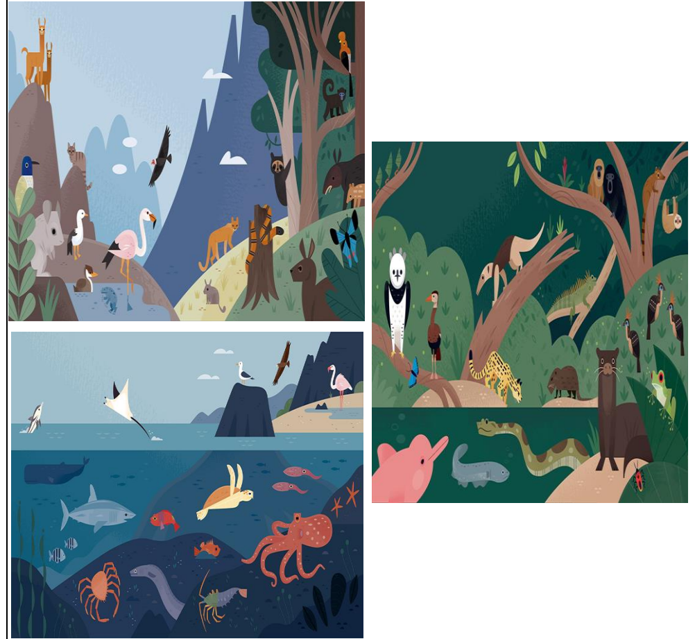
Fig 4.4.2 There are five different classes of animals. The study of animals is called zoology.