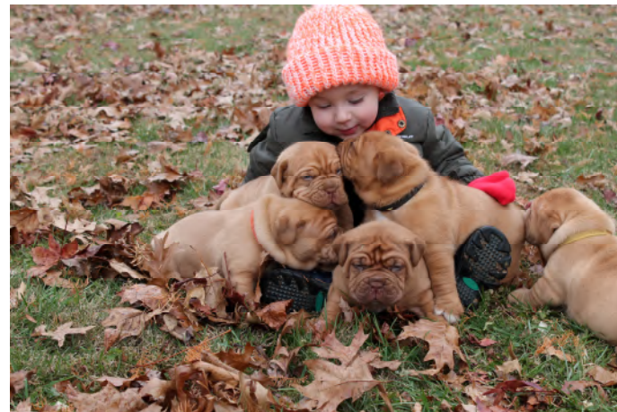
A person with a generous heart and compassion FOR ALL BEINGS... leads a blessed life - Master Cheng Yen

We will be developing our creative skills by using recyclable materials to paint with and create junk art. We will create masks using a range of materials and continue to develop our scissor work. We also decorate rocks for our Nature Garden.