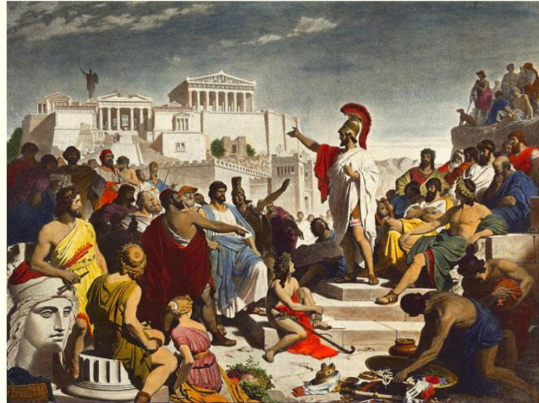
Gathering of Athenians