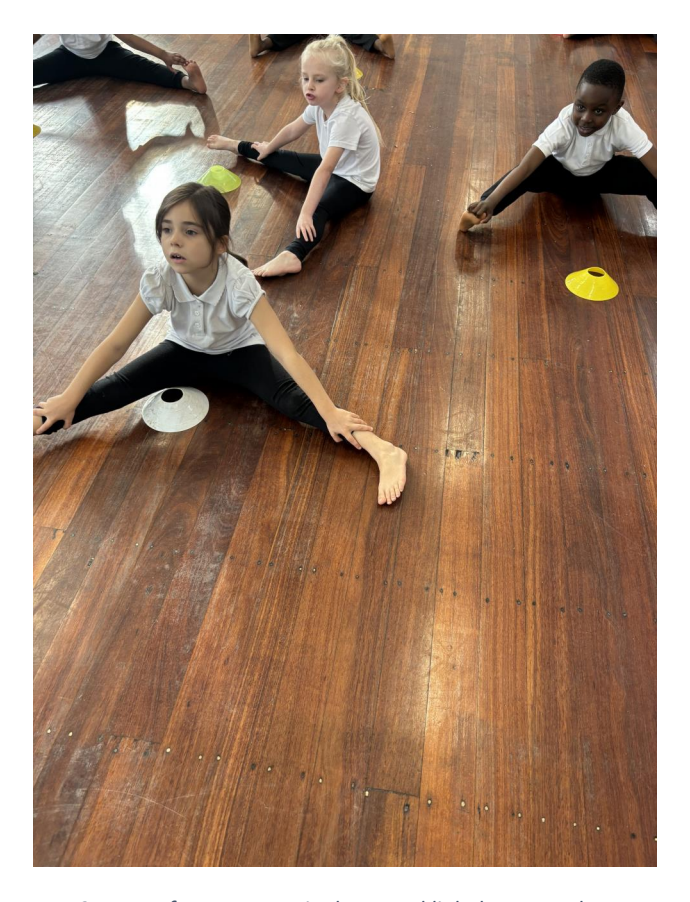
9 - To preform gymnastic shape and link them together.