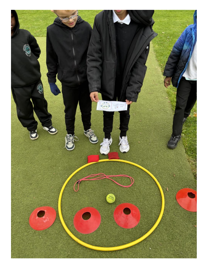
7 - To use team work skills to work as group to solve problems.