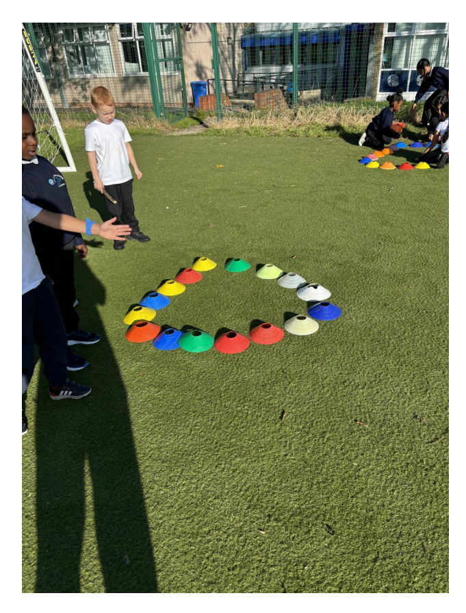
\it 3 - To cooperate and communicate in a small group to solve challenges.