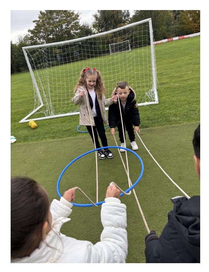
6 - To communicate effectively to develop trust.