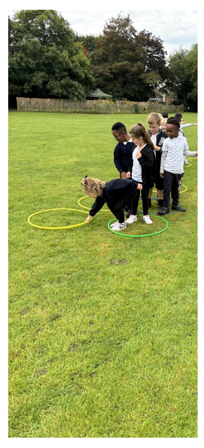
4 - To create a plan with a group to solve challenges.