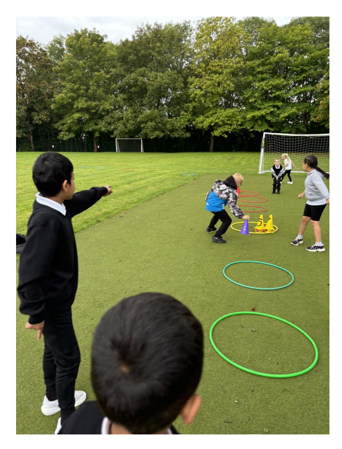
5 - To communicate effectively to develop trust.