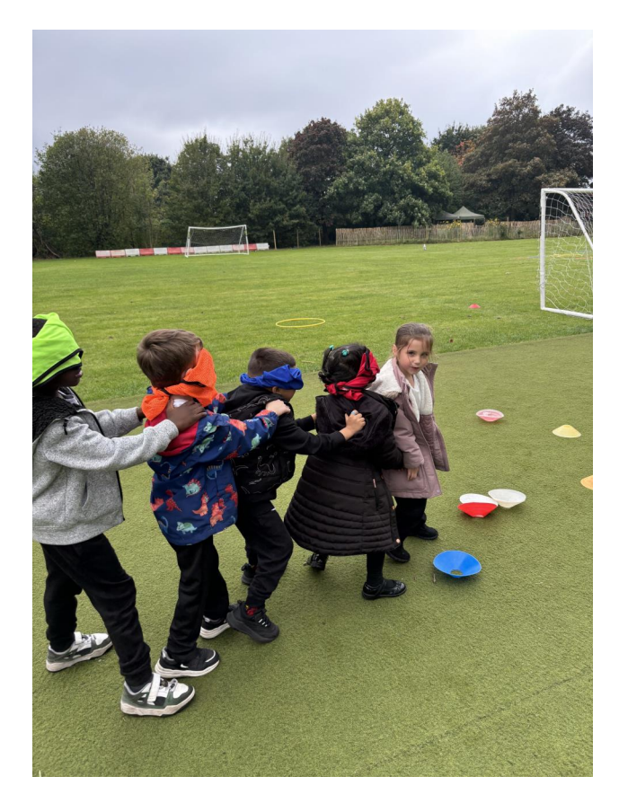
4 - To use speaking and listening skills to lead a group.