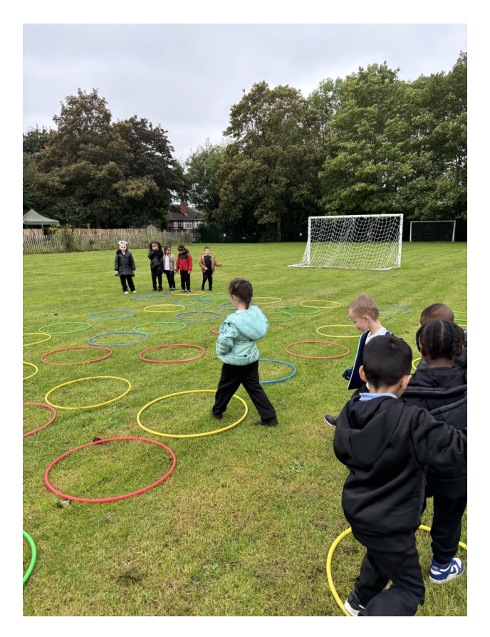
3 - To develop talking, listening and sharing skills.