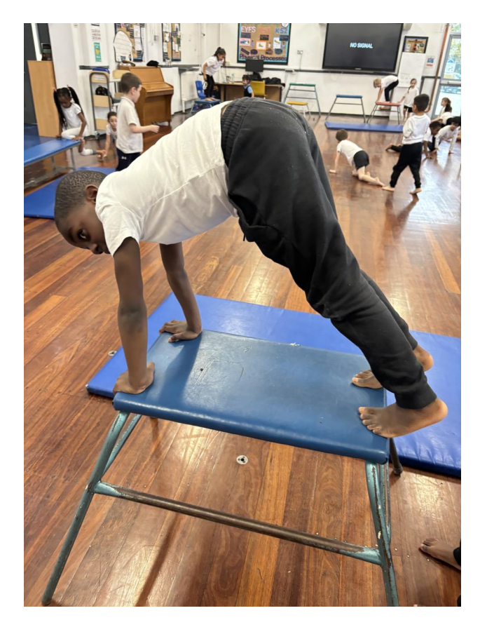
\ensuremath{\textit{8}} - To develope and combine traveling movements.