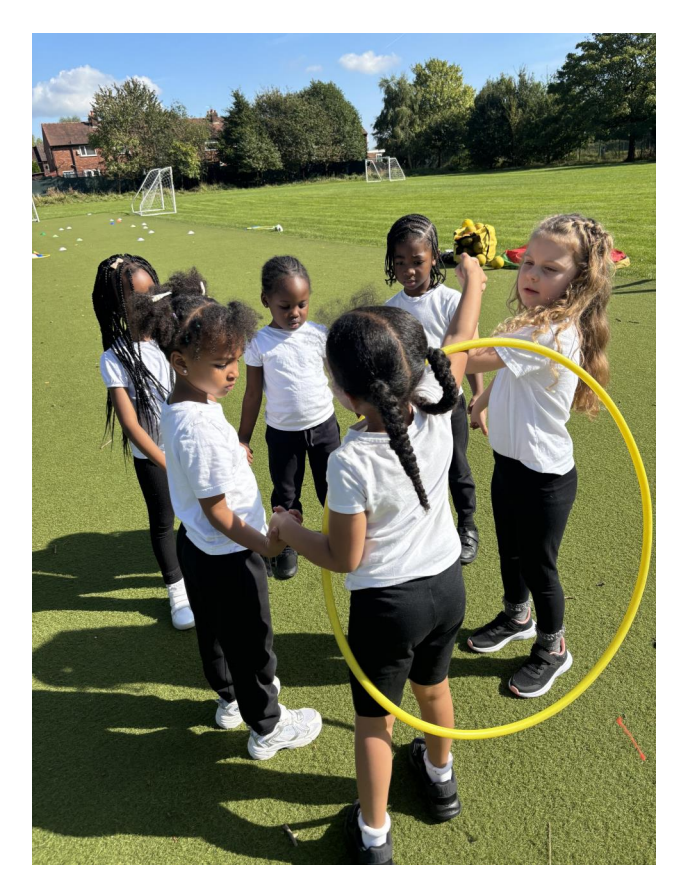
2 - To explore and develop working as a team.